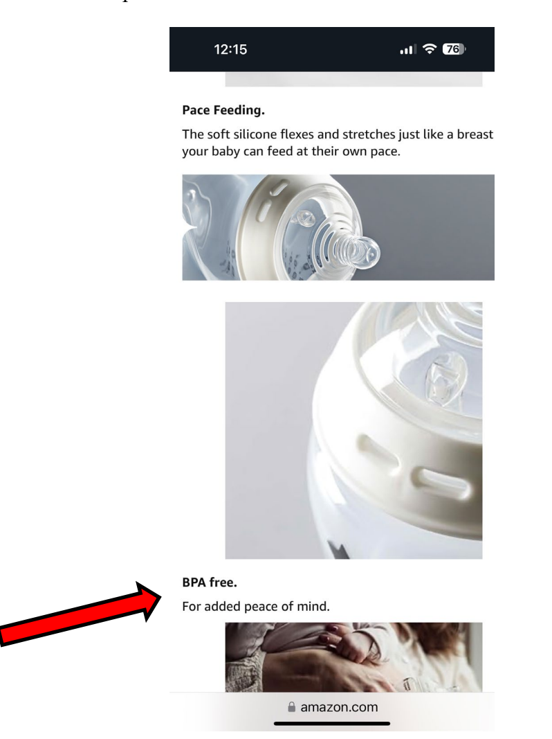
42. Defendant's Products are manufactured, distributed, and sold throughout the United States, including Connecticut. They are sold in-store at mass-market retailers and online at places like Amazon.com. Defendant's "BPA Free" Representations appear on the front labeling of the Products, Defendant's website, and retailers' websites.

Defendant's "BPA Free" Representations are also made consistently on Defendant's website, https://www.tommeetippee.com/en-us/, and Defendat's Products' pages on various retailers' websites. For example: